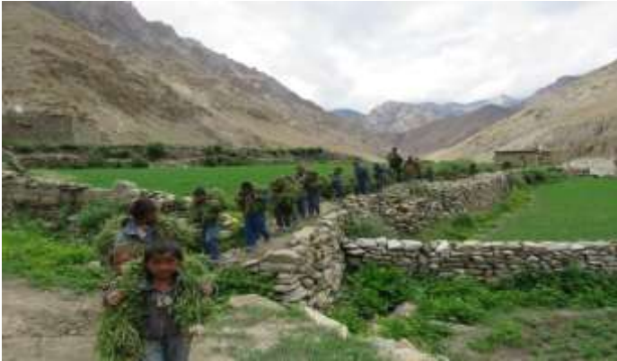
Figure 14: Children cleaning up the bushes and unnecessary grasses on apple farm

The village committee had supported the village to construct wall for the apple plantation project in 2018. The watering and caring of apple plantation project is supported by Tashi Sumdho Basic School from this year.