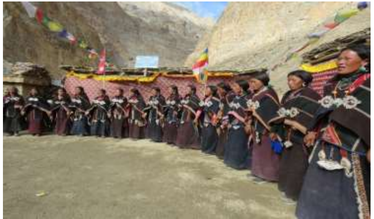
Figure 9: Women of Ku village performing cultural dance in occasion

The most celebrated festival in Nepal is dashain, which normally falls in the time of September or October. The festival is celebrated across the country for 10 days. Each day symbolize its own importance and signifies religious purpose. The festival celebration is often regarded as prayer ceremony held at village and school because these prayers is blessing for the villagers and children. The villager make circle holding each other hand and dance in traditional way by singing cultural song simultaneously.