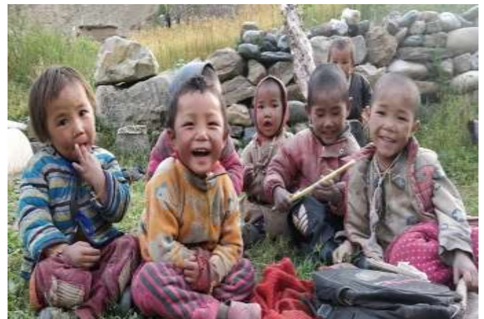
Figure 6: Beautiful smiling face of children

Nevertheless, the circumstances and situation of COVID-19 even appear to be worsening day by day that lead to late transportation and delivery of school materials. The pre-planning of adding grade 5 was also not able to be accomplished due to the dreadful situation of the virus. Although there was a travel restriction, we were able to reach Ku village by following the medical procedure and terms. On the other side, 2020 was a good