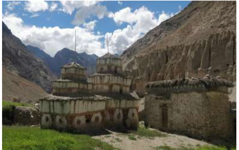
Figure 2: Stupas of Ku Village

Our vision is to create opportunities to students who are well rounded, responsible and diligent by providing quality education.