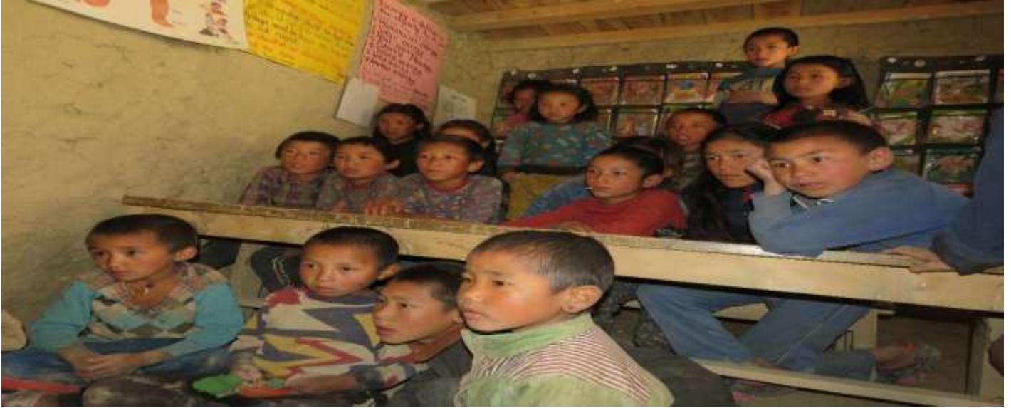
Figure 5: The children of Ku school learning with curiosity

Well, the world itself knows about what mysterious stuff is going out there as the newly discovered virus called, ‘Severe Acute Respiratory Syndrome Coronavirus 2’ also shortly abbreviated as ‘SARS CoV-2’. The evolvement of virus had been an impactful reason for the disturbances and inappropriate operation of schooling this year.