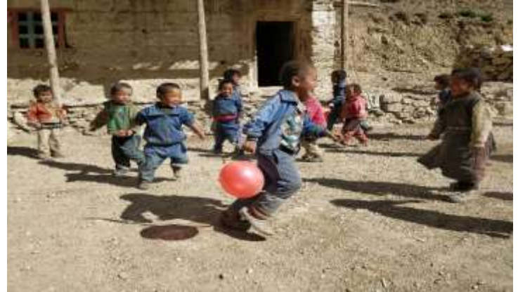
Figure 7: Students enjoying balloon game on Good Friday

These outdoor activities helps to brainstorm and expose the potential of students.