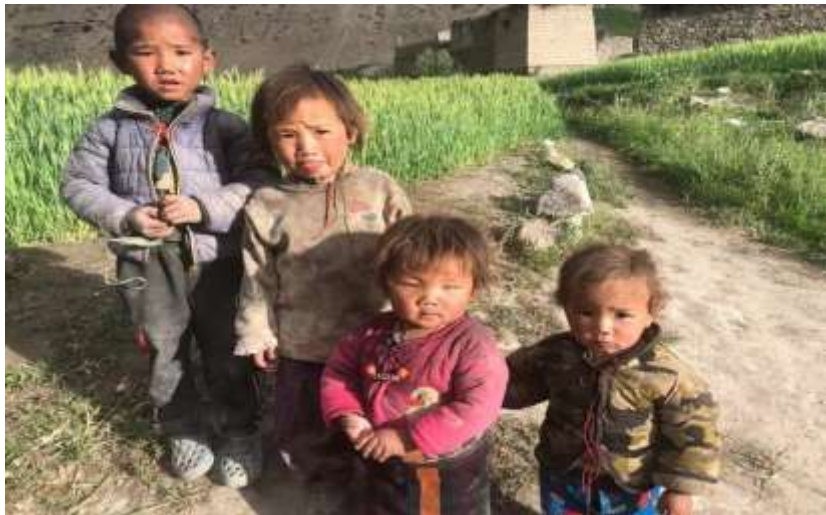
Figure 3: Children in Ku Village