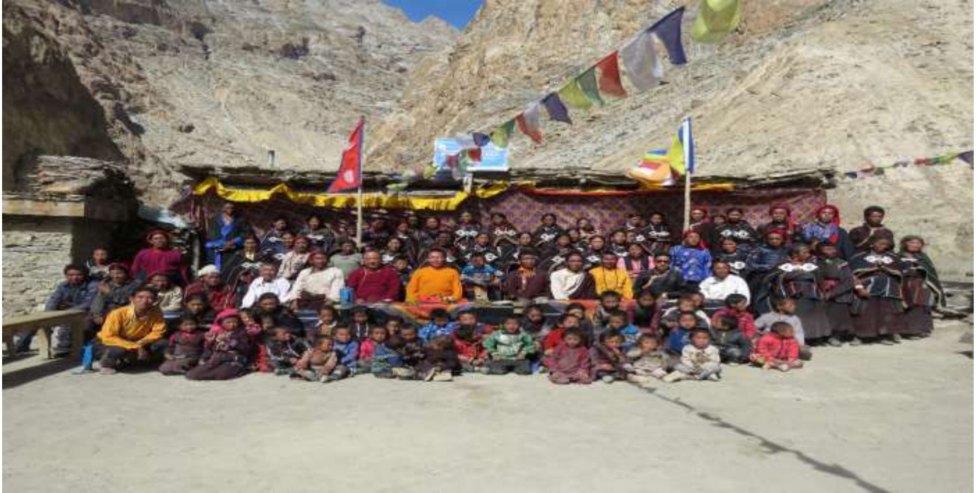
Figure 1: Group pictures of school students, SMC members and villagers