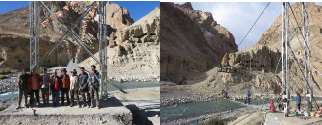
Figure 10: The successful project on Suspension Bridge Construction

Before even the construction of bridge, the lifestyle of villagers was very difficult as the way of the village to other passis divided by river. Across the river, a barren land is suitable for domestic cattle like yak and horse to graze. During raining season, the level of river rises of very high that it gets difficult of villagers to cross it. In order to hunt yarsagumba in season, the villagers had to cross the river. So, the river has always been a big problem for the villagers.