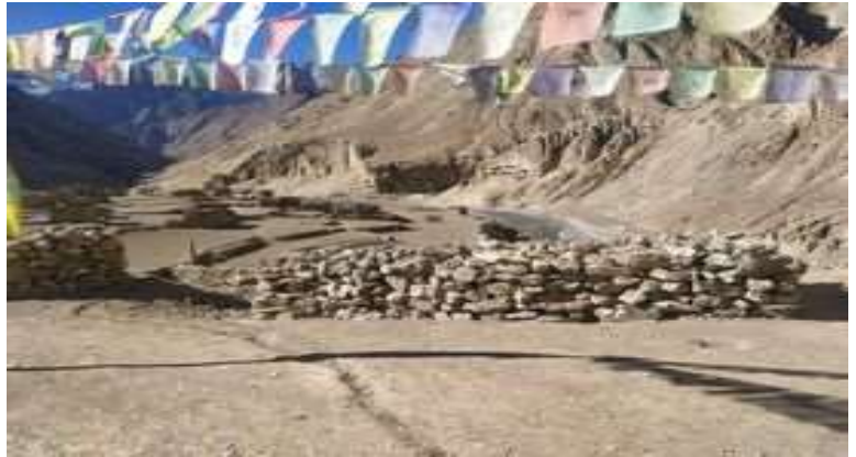
Figure 13: Stone Piling of 2020 A.D

The cost of stone piling for the year 2020 is expensive because we have collected 7 piles of stone this year realizing that the collected piles of stone in the year 2019 was not sufficient for the construction of two classrooms. For each pile we had to pay Rs. 20000 to the community/villagers. And out of 7 piles, 1 pile of stones was contributed by community/villagers without charging any cost.