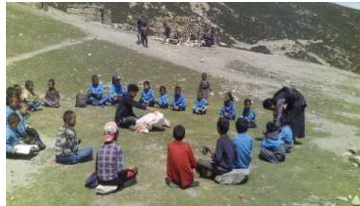
Figure 8: Annual Picnic

School is a place where children can openly smile and learn abundant of knowledge to lead beautiful Life. However, children in school also need break so they can laugh and enjoy limitlessly. Therefore, we