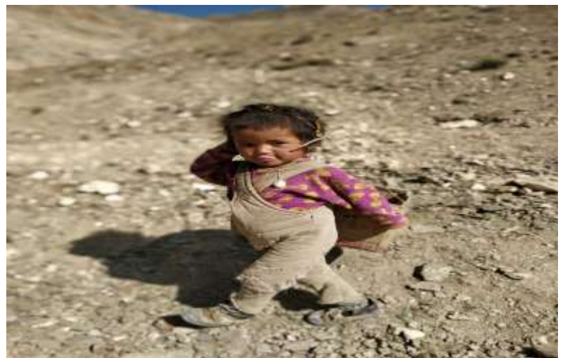
Figure 4: A small boy carrying cow dungs

Our mission is to provide children with high quality education with inclusive environment and encouraged to developed their potentials that build foundation for lifelong learning.